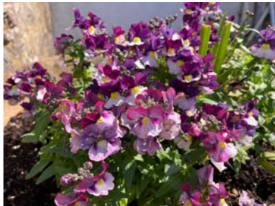
Nemesia Berries and Cream