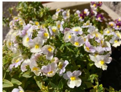
Nemesia Easter Bonnet