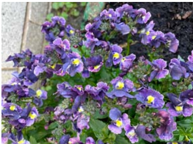
Nemesia Raspberry Cream